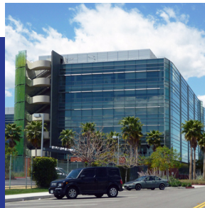
Creative Campus Glendale, California