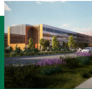
Office Building Midland, Texas