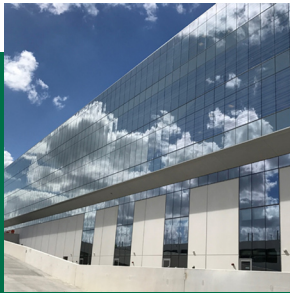
Corporate Center Sunrise, Florida