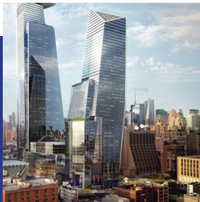
Hudson Yards Tower C New York, New York