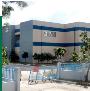
Office Building Cavite, Philippines